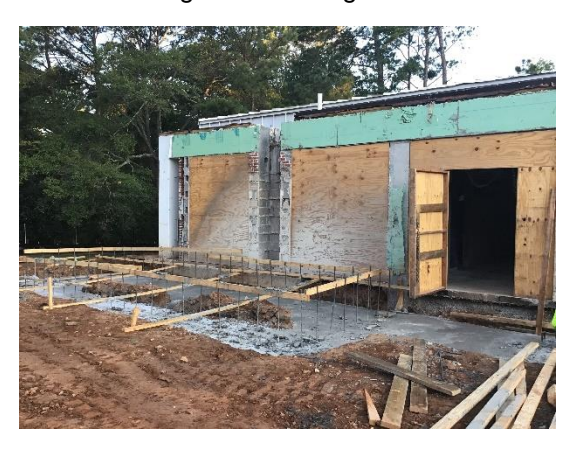
Foundations at Stair 2