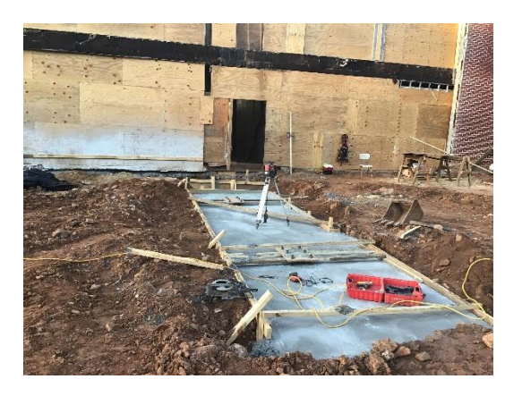
New Building Foundation