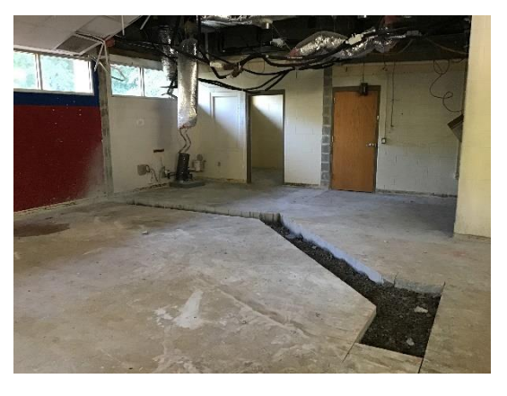
Saw Cutting for New Water Lines