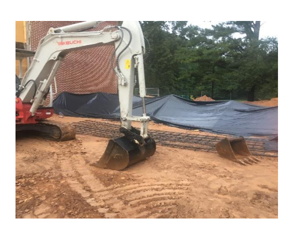
Excavating New Building Foundation